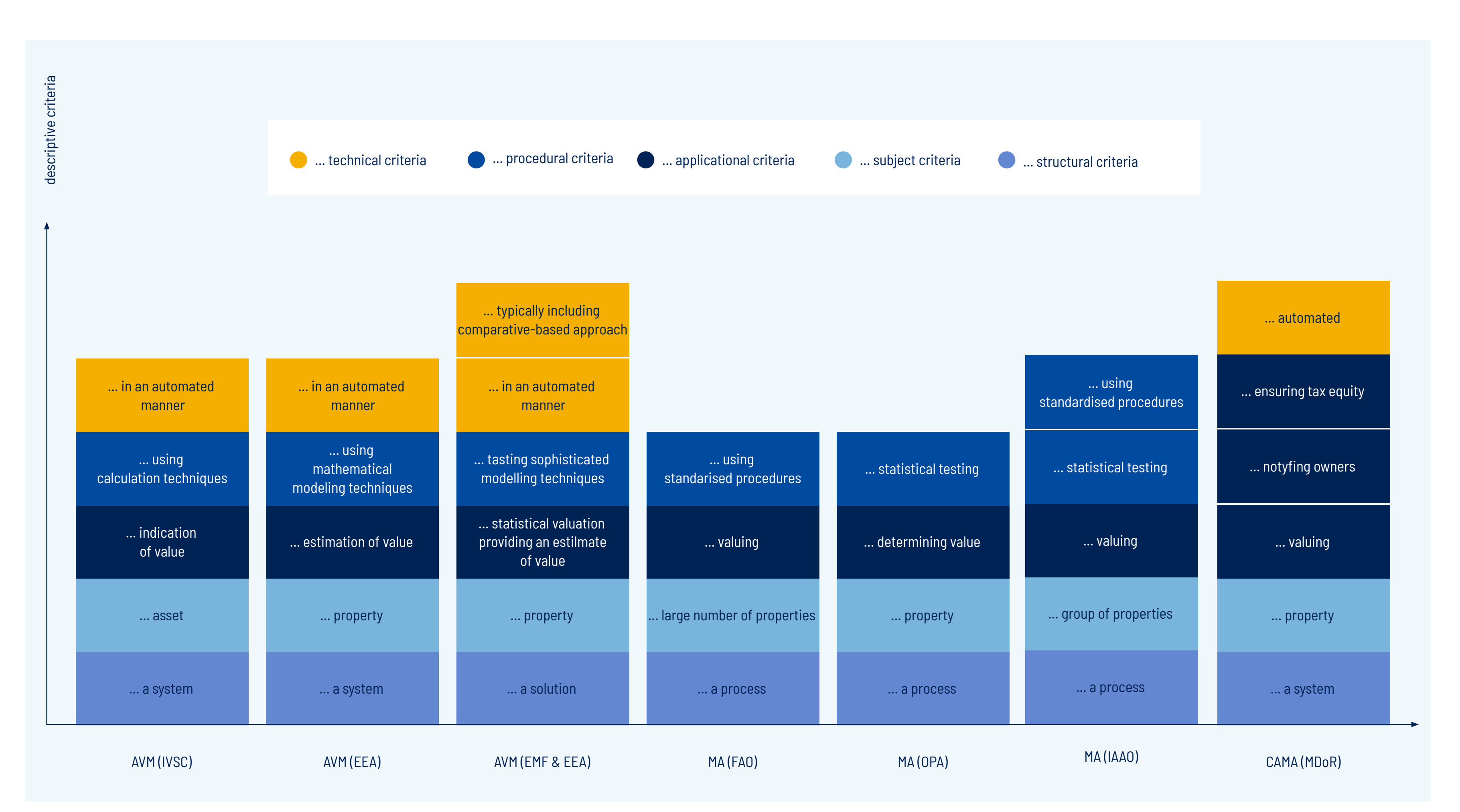
Picture 1. Comparison of the automated valuation terminology.

There is a clash between two opposing approaches. The opponents underline the advantages of traditional valuation methods and approaches and faith in the competence and objectivity of property valuers who carry out personal inspection on the property. On the other hand,