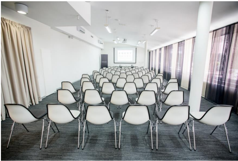
Conference room - Salvador

Conference venue is at Envoy Conference center at Gospodar Jevremova street No 47